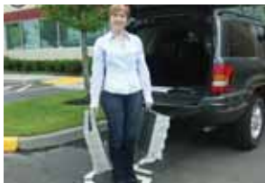
Separates for transport and storage