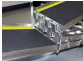
New hinge design