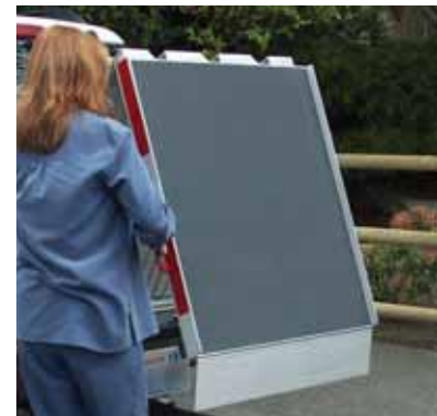
Spring assisted hinge