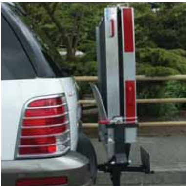
Folds into a compact unit