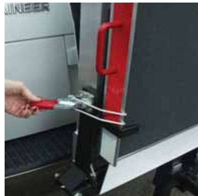
Locking latch assures a rattle-free ride