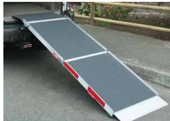
Extends to 8' length and features side rail safety reflectors

* Weights are approximate and may vary. Consult your equipment's owner guide for proper degree of incline. Never exceed its recommendations.